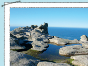
ALTO DO PRÍNCIPE

A rock pierced by the action of the wind and the salty environment. You can enjoy beautiful views of the lake and the cliffs from the nearby observatory.