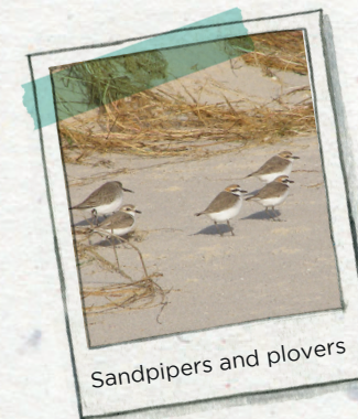
Sandpipers and plovers

THE BEACHES are located on the calmer part of the coast, where the sea deposits the sand. This sand is retained by the dune plants, thus preventing beach erosion.