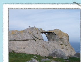
PEDRA DA CAMPÁ

Located at the highest point that can be visited. An ideal place to contemplate the cliffs and the flight of the gulls that breed there. To avoid disturbing the birds, do not approach or feed them.