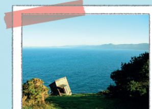
O PEITO OBSERVATORY

The O Peito Lighthouse and Observatory, with a beautiful panoramic view of the rias. A good place to observe the seabirds that breed on the cliffs: yellow-legged gulls and shags.